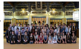
Meeting Dharma Friends from Hawaii, Buddhist Churches of America, South America, and Japan!