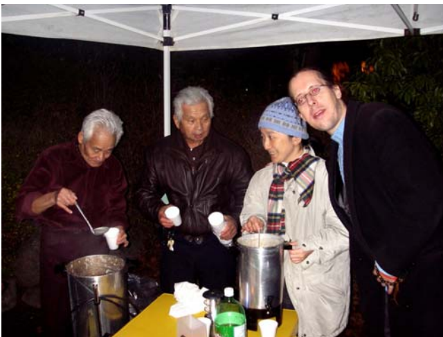
Members handed out cups of warm ama-sake or glasses of ginger-ale to attendees.