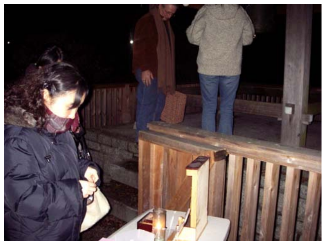
A student pauses before the obutsudan after taking her turn at striking the bell.