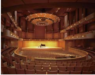
Chan Centre Concert Hall